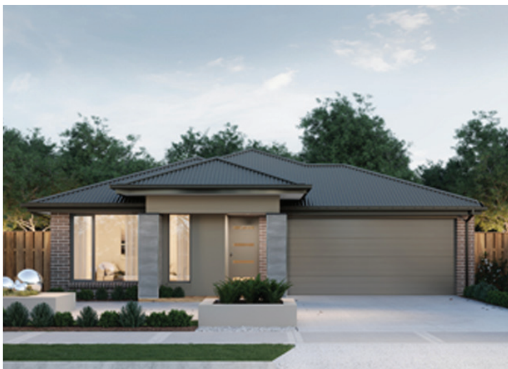
BALLINA 250 Lot 404 (392m 2 ) Stage 4