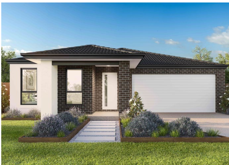
JOURNEY DRIVE WESTWOOD Lot 407 (392m 2 ) Stage 04