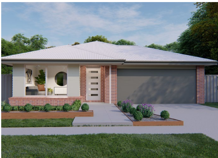
BLITZ Lot 410 (392m 2 ) Stage 4

TAKE $20K OFF + UP TO $25K OF EXTRA VALUE