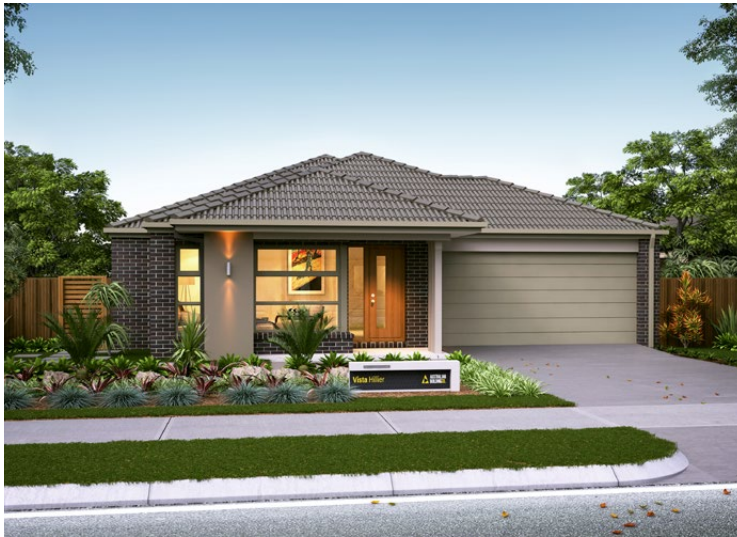
LLOYD 20 SS VISTA FACADE Lot 415 (392m 2 ) Stage 4

WAS $570,354, NOW $544,454 + TAKE OFF AN EXTRA $20K